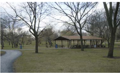
Picnic Grounds and canopy