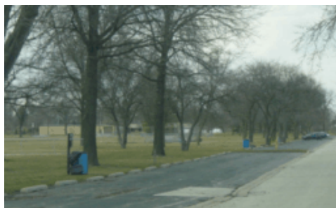
Parking along Edgewood Road