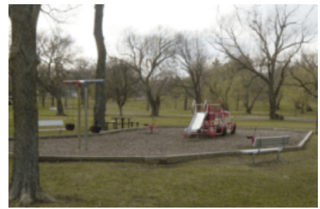
Playground for the kids

Map of the parade route from Glenbard East High School to the Lombard Commons Park